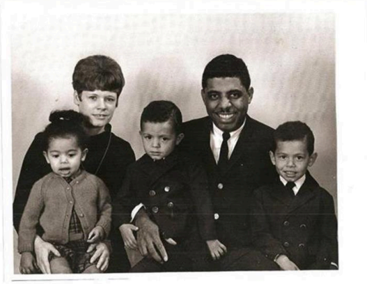
The Whole Family