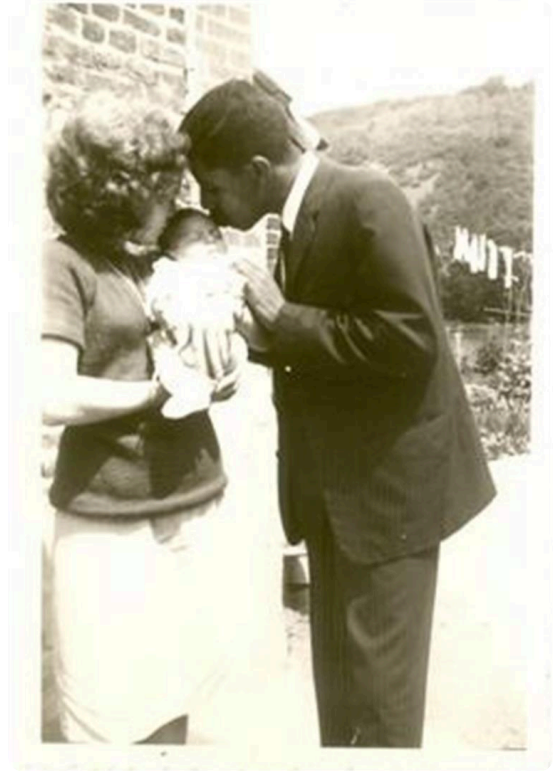
First Born 1963 France