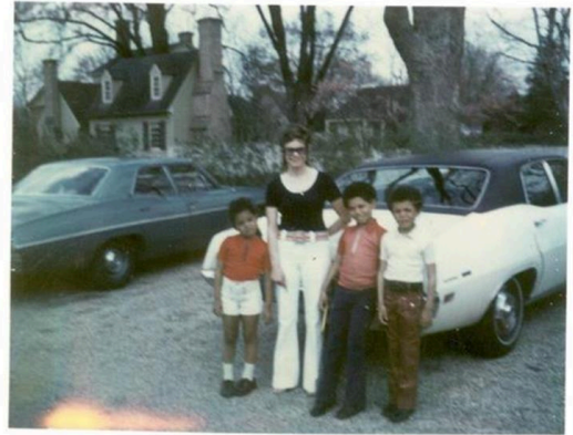
A mom and her babies